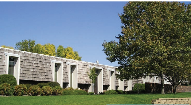
Our new building in Golden Valley